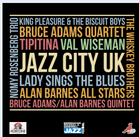
Jazz City UK Volume 2: The Jam Sessions Two legendary Birmingham sessions featuring 21 of the finest British Jazz Musicians