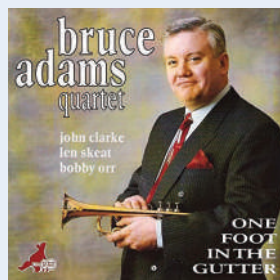
Bruce Adams Quartet One Foot In The Gutter The sensational trumpet star's first release – a stunning mainstream jazz album

CDs £10 each including P&P or any three for £20