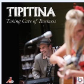
Tipitina Taking Care of Business Dr John, Professor Longhair, Randy Newman et al, delivered by the tremendous Tipitina