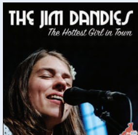
The Jim Dandies The Hottest Girl In Town The Jim Dandies specialise in lowdown jazz, hokum and pre-war bawdy Blues. November release.