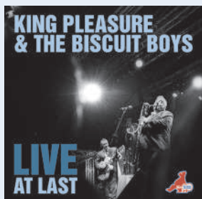
King Pleasure & The Biscuit Boys Live At Last Red hot jump and jive from the kings of swing