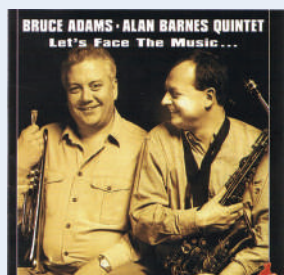
Bruce Adams / Alan Barnes Let's Face The Music World-class Bebop with all-star quintet.